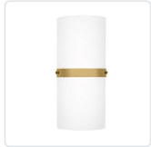
WS3413-BG Brushed Gold